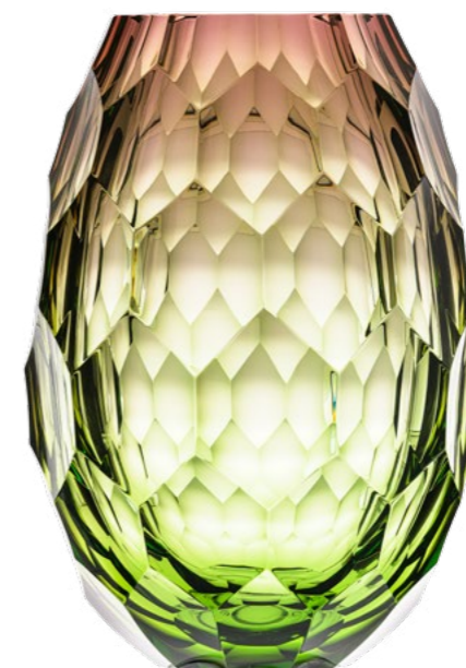
vase / ocean green - rose 14,5 x 30 cm 5.7 x 11.8 inch 3211

The refined hexagonal cut splinters the basic oval shape of this robust vase into a mosaic of many different views of the same reality. The sharp edges of the honeycomb cells are divided by strips, and then they immediately rejoin into a new story.