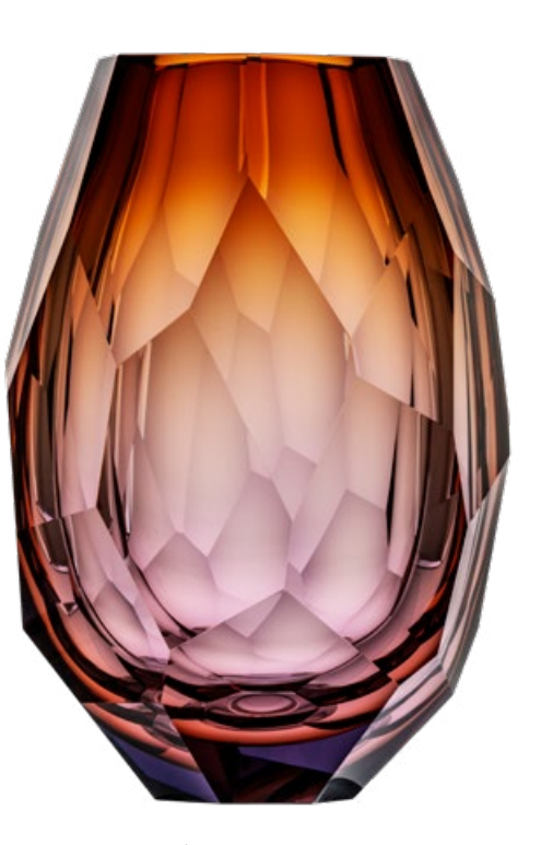
vase / alexandrite - aurora 14 × 30 cm 3211

Width (upper rim) × height (cm). Any slight deviations in dimensions or colour are evidence that items are handmade by our master craftsmen. We are available and happy to answer any enquiries for more information.