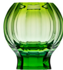
vase / Zambra beryl underlaid with reseda base: ocean green 17 × 26,8 cm 6.7 × 10.6 in 3458

Width (upper rim) × height (cm/in). Any slight deviations in dimensions or colour are evidence that items are handmade by our master craftsmen. We are available and happy to answer any enquiries for more information.