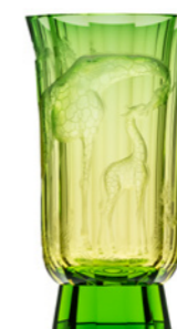
vase / Mambo engr. Giraffes eldor underlaid with green base: ocean green 19 × 33,5 cm 7.5 × 13.2 in 3457 limited edition / 30 pcs

Width (upper rim) × height (cm/in). Any slight deviations in dimensions or colour are evidence that items are handmade by our master craftsmen. We are available and happy to answer any enquiries for more information.