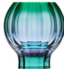
vase / Zambra alexandrite underlaid with green base: ocean green 17 × 26,8 cm 6.7 × 10.6 in 3458