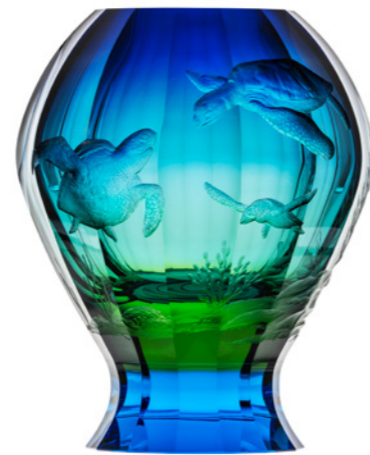
vase / Merengue enr. Turtles ocean green underlaid with blue base: aquamarine 12,9 x 25,4 cm 5,1 x 10 in 3455 limited edition / 30 pcs