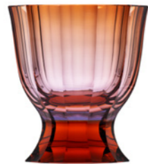
vase / Paso Doble alexandrite underlaid with aurora base: topaz 25.5 × 27,3 cm 10 × 10.7 in 3456