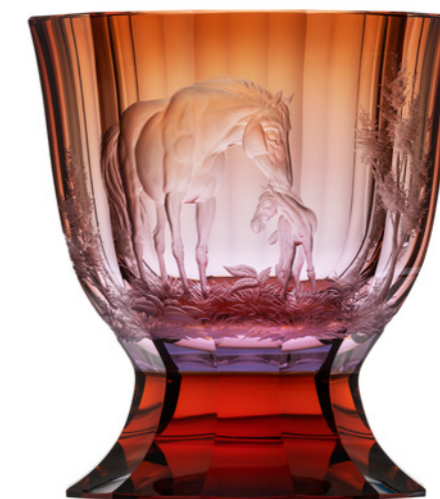
vase / Paso Doble engr. Horses alexandrite underlaid with aurora base: topaz 25.5 × 27.3 cm 10 × 10.7 in 3456 limited edition / 30 pcs

Width (upper rim) × height (cm/in). Any slight deviations in dimensions or colour are evidence that items are handmade by our master craftsmen. We are available and happy to answer any enquiries for more information.