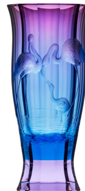
vase / Fandango engr. Flamingos aquamarine underlaid with rose base: alexandrite 17 × 36 cm 6.7 × 14.2 in 3454 limited edition / 30 pcs

To create our new collection of motifs from the life of animals, we have chosen emotions as our inspiration. In 2020, the world experienced an unexpected situation that turned the lives of many of us upside down. We want to address this with positive emotions, the emotions of relationships, of family. Thus, we chose the generational bond between pup and mother, or pup and father, to symbolise the relationships of us all.