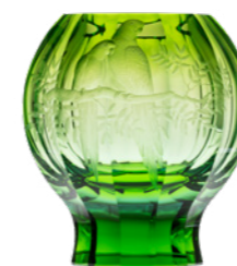
vase / Zambra engr. Parrots beryl underlaid with reseda base: ocean green 17 × 26,8 cm 6.7 × 10.6 in 3458 limited edition / 30 pcs

Parental love is one of the most powerful emotions – in both the worlds of people and animals. It is also an emotion without which the world as we know it could not exist. Vases from this collection, inspired by the close bond between parent and child, will inject every interior with positive life energy, flowing from one generation to another.