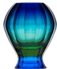
vase / Merengue ocean green underlaid with blue base: aquamarine 12.9 × 25,4 cm 5.1 × 10 in 3455