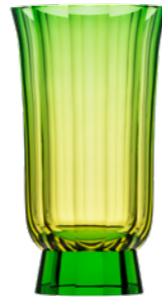
vase / Mambo eldor underlaid with green base: ocean green 19 × 33,5 cm 7.5 × 13.2 in 3457