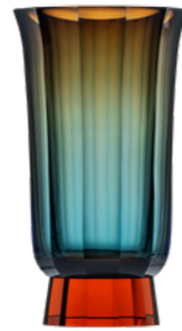
vase / Mambo aquamarine underlaid with aurora base: topaz 19 × 33,5 cm 7.5 × 13.2 in 3457