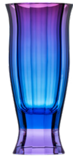
vase / Fandango aquamarine underlaid with rose base: alexandrite 17 × 36 cm 6.7 × 14.2 in 3454

The vases are named after Latin dances, reflecting their rhythm in colour hues and their transitions, as well as in the chiselled edges. Let yourself be drawn into the fiery Spanish fandango, the merengue – the national dance of the Dominican Republic, the paso doble celebrating the victorious toreador, the mambo of Cuba and, last but not least, the Andalusian zambra, a traditional variant of the famous flamenco.