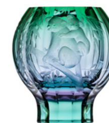
vase / Zambra engr. Koalas alexandrite underlaid with green base: ocean green 17 × 26,8 cm 6.7 × 10.6 in 3458 limited edition / 30 pcs